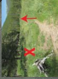
TRAIL FORK MILE 1.4