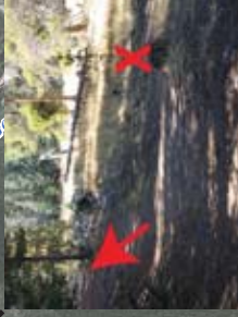
TRAIL FORK MILE .95